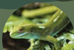
Moko Kākariki Green Gecko