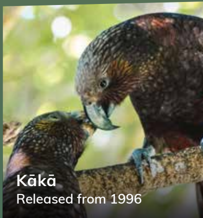
Kākā Released from 1996