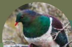
Kererū Wood Pigeon