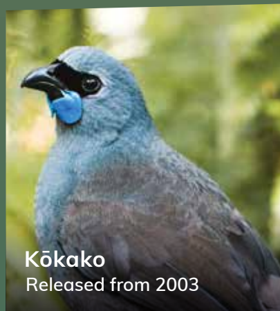
Kōkako Released from 2003