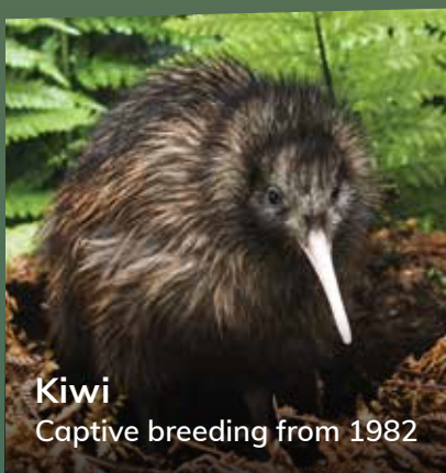
Kiwi Captive breeding from 1982