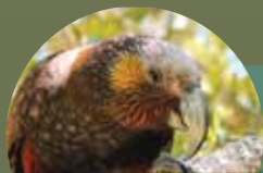
Kākā Bush Parrot

How many of these creatures can you find at Pūkaha?