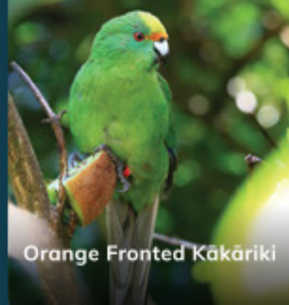
Orange Fronted Kākāriki