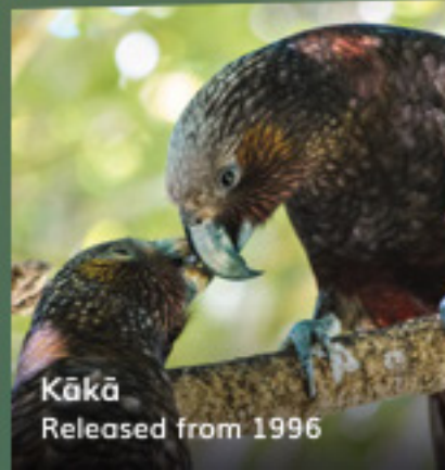
Kākā Released from 1996