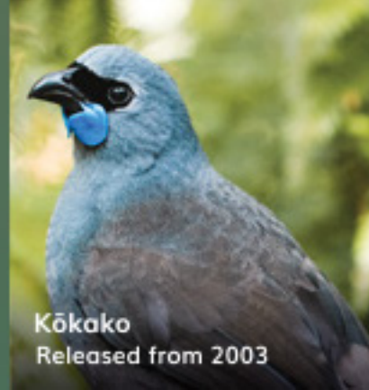
Kōkako Released from 2003